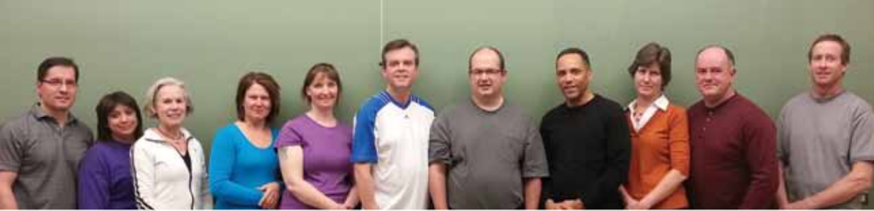
The Young Onset Support Group, Winnipeg, Manitoba